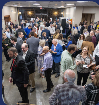
THE BUSINESS EVENT OF THE YEAR