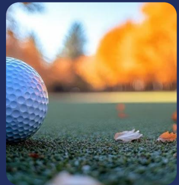
FALL GOLF CLASSIC