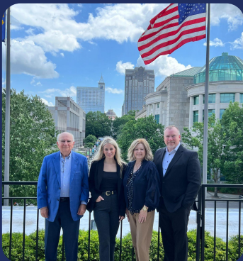
LEGISLATIVE TRIPS TO RALEIGH