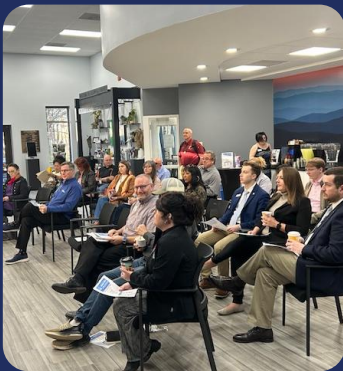
BUSINESS FOCUSED EVENTS